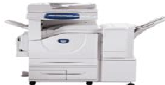
Robust Office Finisher staples sets up to 50 sheets in 3 selectable positions.