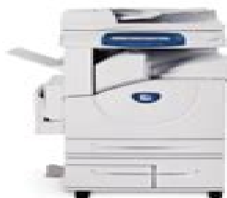
Compact Integrated Office Finisher staples sets up to 50 sheets in a single corner position.