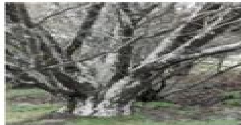
2. Light gray colored bark