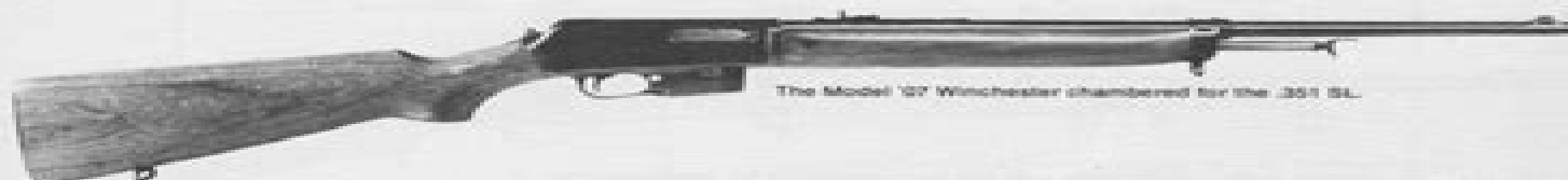
The Model '07 Winchester chambered for the .351 SL.