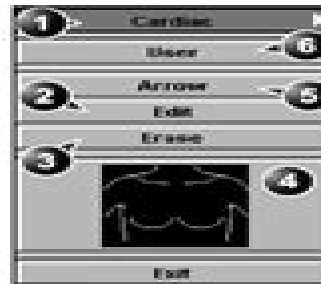
Figure 2-14: The Bodymark menu