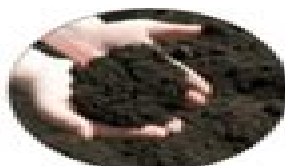
Black cotton soil