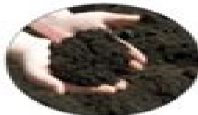
Black cotton soil