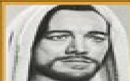
MAX VON SYDOW as Joseph