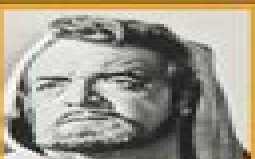
VAN HEFLIN as Herod Antipas

THE GEORGE STEVENS PRODUCTION • "THE GREATEST STORY EVER TOLD" • MAX VON SYDOW • MICHAEL ANDERSON, JR. • CARROLL BAKER • INA BALIN • PAT BOONE • VICTOR BUONO RICHARD CONTE • JOANNA DUNHAM • JOSE FERRER • VAN HEFLIN • CHARLTON HESTON • MARTIN LANDAU • ANGELA LANSBURY • JANET MARSDEN • DAVID MCCALLUM • BODDY MCDOWALL DOROTHY MCGUIRE • SAL MINED • NEHEMIAH PERESOFF • DONALD PLEASENCE • SIDNEY POOTER • CLAUDE RAINS • GARY RAYMOND • TILLY SAVILLAS • JOSEPH SCHULDKRAUT PAUL STEWART • JOHN WAYNE • SHELLEY WINTERS • ED WYNN • with MEMBERS OF THE ISRAELI DANCE THEATRE OF ISRAEL • ADAPTED BY JAMES LEE BARRETT AND GEORGE STEVENS PRODUCED AND DIRECTED BY GEORGE STEVENS • IN COLLABORATION WITH CARL SANDBURG • MUSIC BY ALFRED NEWMAN • FILMED IN ULTRA PANAVISION® TECHNICOLOR®