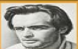
DAVID MCCALLUM as Herod's Minister