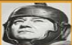
JOHN WAYNE as The Centurion