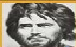
CHARLTON HESTON as John the Baptist