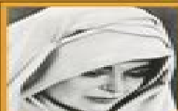
DOROTHY MCGUIRE as Mary