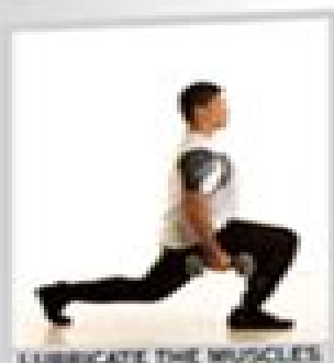
LUBRICATE THE MUSCLES