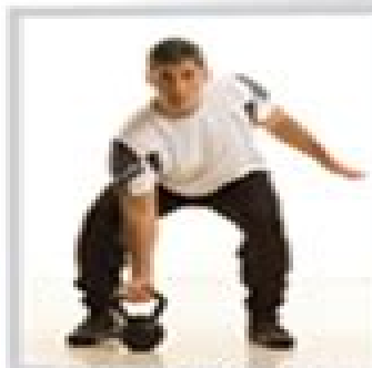
INCREASE BLOOD FLOW

JOIN THE THOUSANDS WHO HAVE USED THE MING METHOD TO AVOID DRUGS AND SURGERY