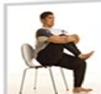
HEAL JOINT PAIN