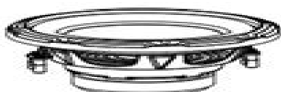
SUB 10 DUAL