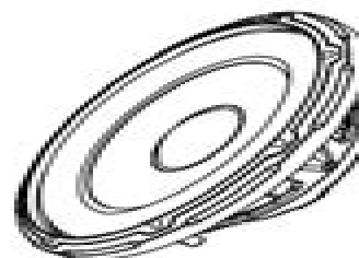
SUB 12 SLIM