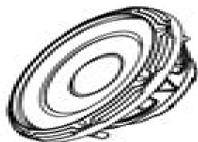
SUB 10 SLIM