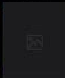
Sur La Table Marinara