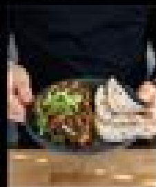
Pakistani Chicken Karahi