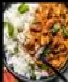
Slow Cooker Chicken Tikka M...