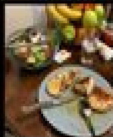
Mom's Lemon Chicken Marinade