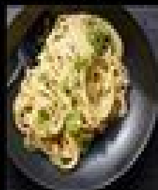
San Francisco- Style Vietnamese...