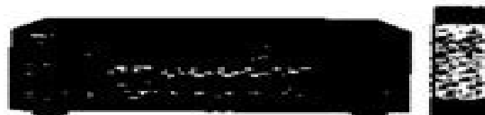
Black and Golden models