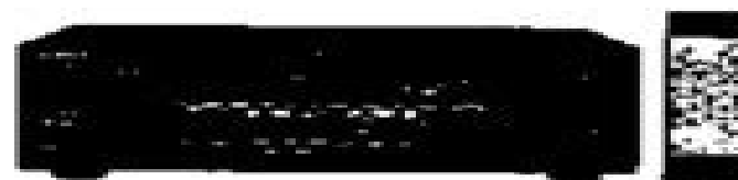
Black, Silver, and Golden models