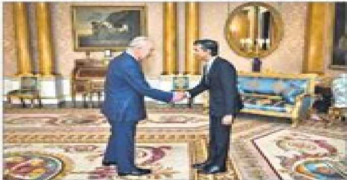
King Charles III shakes hands with Rishi Sunak at the Palace of Westminster in London.

Agencies LONDON: Conservative leader Boris Johnson has today said as UK's outgoing Prime Minister in 2022, the first person to do so may be from the South of England, and the first person to do so may be from the South of England. The position, announced by King Charles III, would mean the Prime Minister's office would be in the South of England, and the first person to do so may be from the South of England. Johnson's office today said the Prime Minister's office would be in the South of England, and the first person to do so may be from the South of England. Johnson's office today said the Prime Minister's office would be in the South of England, and the first person to do so may be from the South of England.