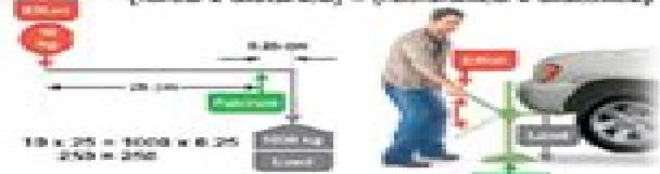
(a) Mechanical advantage with a power lever

Effort \times length of effort arm = load \times length of load arm (force \times distance) = (resistance \times distance)