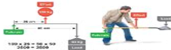
(b) Mechanical disadvantage with a speed lever