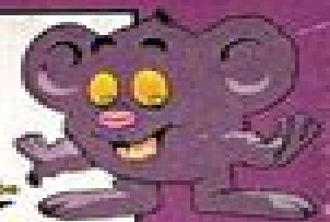
ROCKWART THE TROLL