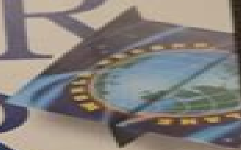
World Record Paper Airplane