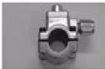
Figure 6: Typical Piercing Valves

IMPORTANT: When unit service is complete, piercing valves should be removed to prevent refrigeration leaks. Nitrogen or another inert gas should be used to purge the tubes while soldering the pierced hole shut.