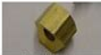
Figure 10: Saddle Fitting

IMPORTANT: Nitrogen or another inert gas should be used to purge the tubes while soldering the saddle fitting to the tube.