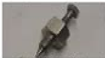
Figure 12: Piercing Tool

NOTE: If the piercing tool is not available, purgify the system with nitrogen or another inert gas, solder the saddle fitting to the tube. With the inert gas set at a low pressure, use the saddle fitting as a guide and carefully drill hole in tube being sure copper shavings are blown out of tube.