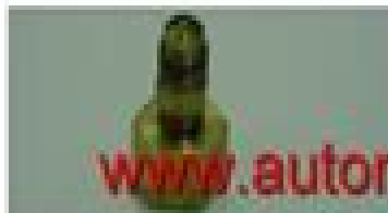
Figure 11: Saddle Fitting and Schrader Valve