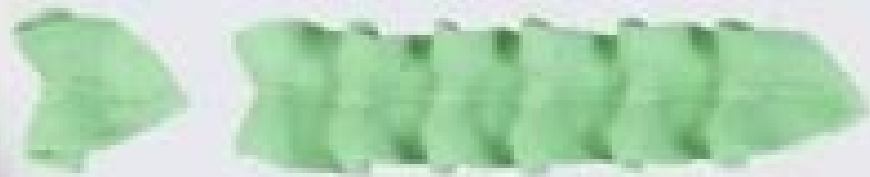
Leaf Border/Borde de hojas/Bordure de feuilles Tpr/Bocalla/Douille: 49