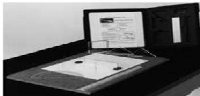
figure 26 -1

1. Draw a line approximately 20 cm long at the center of a sheet of clean, white paper. This will be the baseline. Draw another line normal (normal = 90^\circ ) to the first line using the protractor. Place the plane mirror into the slots of the little pieces of cork in the Plexi-Ray kit so that it will stand-up. Next, place the mirror so that the back (the reflecting surface) is on the first line.