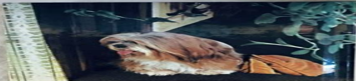
Front cover: Photo by Isabelle Francais of Lhasa Apsos owned by Barbara Wood. Back cover by Vincent Serbin.

This book, illustrated with over 125 full-color photos and drawings, presents sensible, easy-to-follow recommendations about selecting and caring for a Lhasa Apso. It concentrates on providing readers with the information they need and want—all given in an interesting and easy to read style.