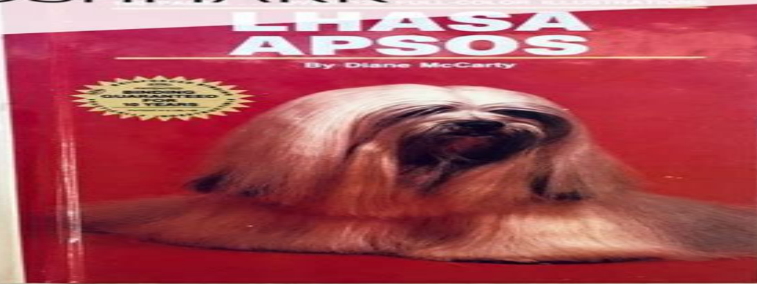
Front cover: Photo by Isabelle Francais of Lhasa Apsos owned by Barbara Wood. Back cover by Vincent Serbin.

This book, illustrated with over 125 full-color photos and drawings, presents sensible, easy-to-follow recommendations about selecting and caring for a Lhasa Apso. It concentrates on providing readers with the information they need and want—all given in an interesting and easy to read style.