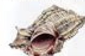
Apple Murex (CB)

Chamaelea lamarckii To 2 in. (5 cm) Elaborate pinkish-white to brownish shell with long teeth.