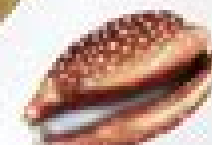
Atlantic Deer Cowrie (CB,CB)

Olivella septentrionalis To 2.5 in. (6 cm) Glossy, yellow to grayish cylindrical shell has markings that resemble lettering. South Carolina's state shell.