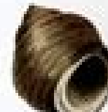
Common Periwinkle (B,V)

Euryspira angulata To 1 in. (2 cm) high Shell has 8-10 ribs, blade-like ribs.