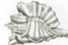
Foliate Thornmouth (W)

Cerithium foliatum To 1.5 in. (4 cm) high Shell has three large, leaf-like flanges. Color varies from white to dark brown depending on location.