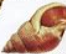
Channeled Nassa (CA)

Scaphella junonia johnstoni To 3 in. (7.5 cm) Deep water Gulf Coast shell only reaches up on shore after storms. Alabama's state shell.