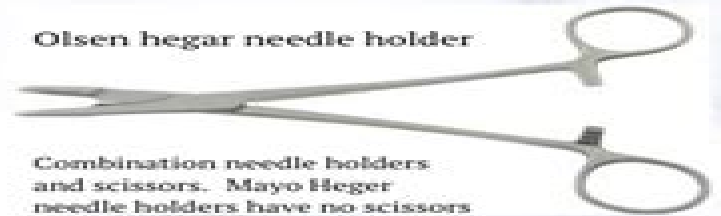
Olsen hegar needle holder

Combination needle holders and scissors. Mayo Heger needle holders have no scissors