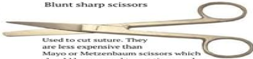
Blunt sharp scissors

Used to cut suture. They are less expensive than Mayo or Metzenbaum scissors which should be reserved to cut tissue only.