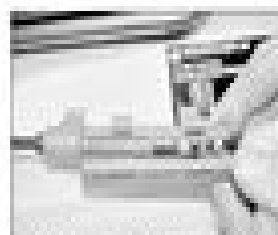
4.69a Separate the front section of the tension release cable