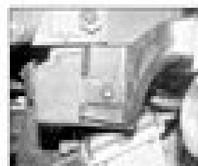
4.69 ... and the one alongside each headlight

8 If the timing belt is to be refitted, mark its