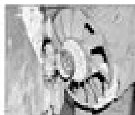
4.70c ... and remove the tension fan unit