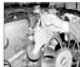
4.70b ... and remove the tensioner