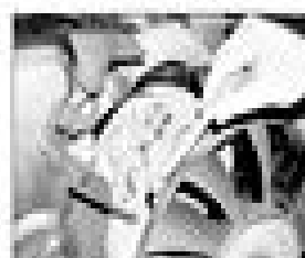
4.70 (Remove the bolts) ...