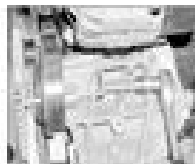
4.70a (Remove the bolt) ...