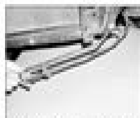
4.65 Attach the power steering pump