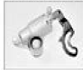
4.74 Timing belt tensioner (tensioner codes A07, A06, A05 and A04)