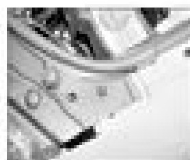
4.68 Then remove the bolt each side at the top of the wing ...

into the cylinderhead channels (see illustrations)