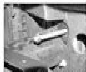
4.64 Take lengths of threaded nut to support the bolt across