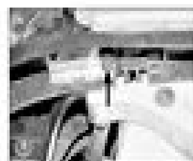
4.67 ... and the one each side under the wing (arrowed) ...