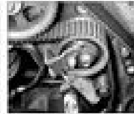
4.75 Timing belt tensioner (tensioner codes A07, A07 and A07)