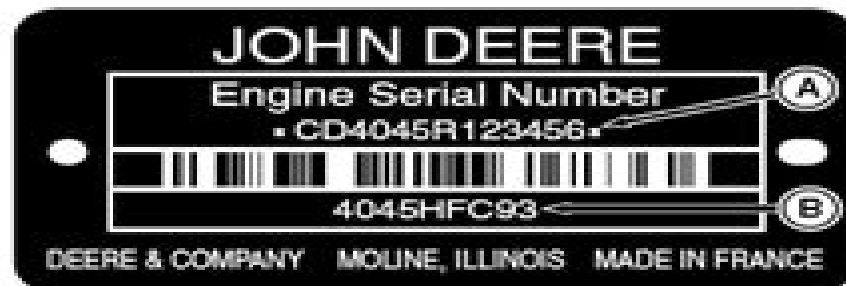
Saran Factory Engine Identification Plate