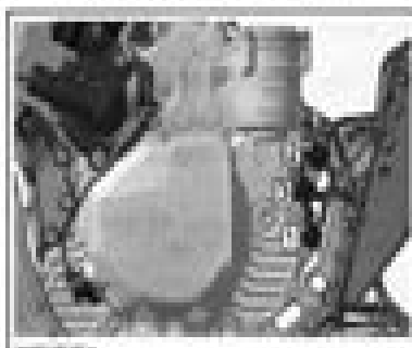
FRONT VIEW REAR VIEW