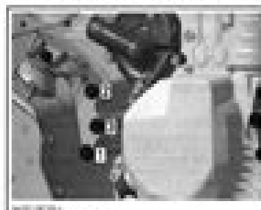
FRONT VIEW REAR VIEW