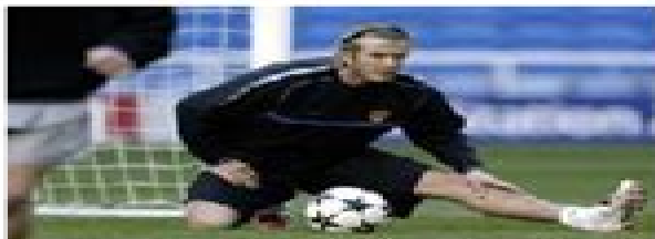
Figure 1: Original image.

The Figure 4 illustrates the algorithm steps. This was implemented using the language C and openCv library. First, the image in RGB was converted to HSV color space, because it is more related to human color perception [1]. The skin in channel H is characterized by values between 0 and 50, in the channel S from 0.33 to 0.68 for Asian and Caucasian ethnics [2]. In this work we used images from different Caucasian people, from different places of the world. Figure 1 illustrates one of the original image processed.