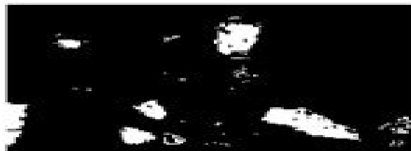
Figure 3: An intermediary image.

Figure 3 illustrates an intermediary image, where all pixels classified as skin (using the range in channel H already established) were set to value 255, and non-skin pixels was fixed to 0.