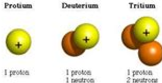
The Nuclei of the Three Isotopes of Hydrogen