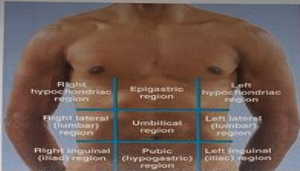
(a) Nine regions delineated by four planes