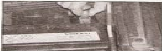
A Check the condition and security of the battery connections.