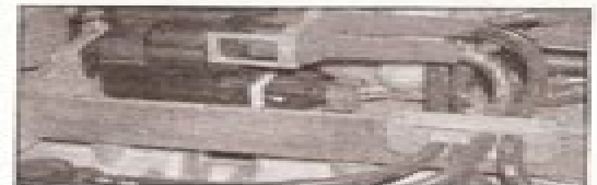
C1 If possible, remove the engine cover to ...