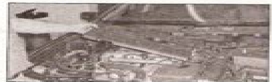
C2 ... check that the ignition coil wiring connectors are securely connected ...