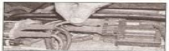
C3 ... and the HT leads (non-GDI engines) are securely connected to both the coils and spark plugs