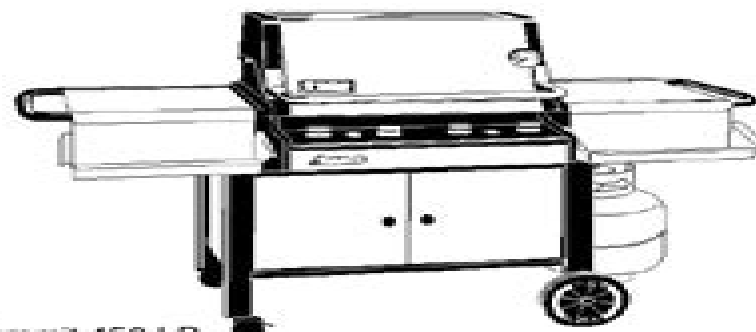
Summit 450 LP