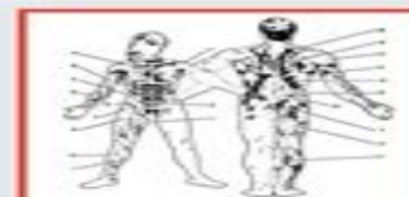
FUNCTIONS AND MUSCLES