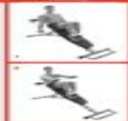
FRONT DELTOID RAISE