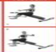
CROSSOVER PULL FEET DOWN