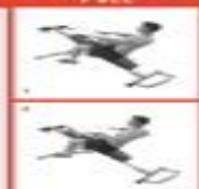
SEATED HIGH PULL