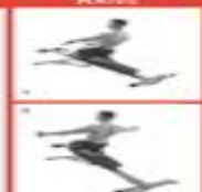
REAR DELTOID RAISE