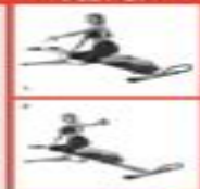
CROSSOVER PULL FEET UP