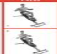
SEATED BENCH PRESS