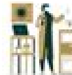
Build a poster that is easy to read and visually appealing. Use graphs to show the results of your study.