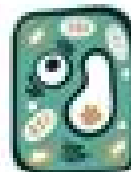
Use illustrations to present your data in a clear form.

Expand on your findings by discussing what methods were used to analyze your data. It can get technical as long as it's simple and direct to the point. Use bullet points for emphasis. Include any graphs, tables, illustrations, and other images that support the study and show a visual analysis of the data. Make sure they are large enough to be seen from a distance but not clutter the poster.