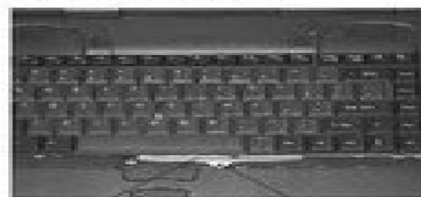
Keyboard metal brace