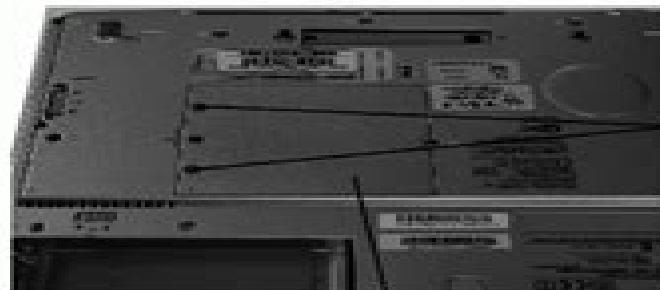
M2.5x2.8 silver flat head screws