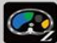
Effective Z Images