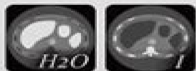
Basis Material Analysis