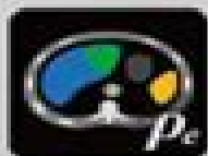
Effective Density Images