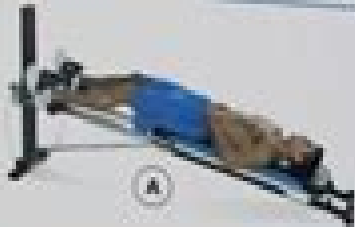
4. Leg Curl (Seated or Lying)