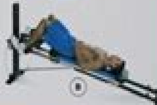
5. Cross Cable Row