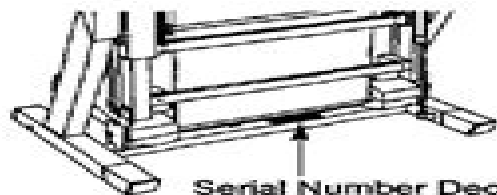
Serial Number Decal

Find the serial number in the location shown below. Write the serial number in the space above for reference.