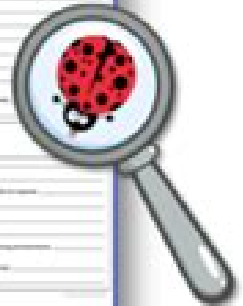
2-Page Student Worksheet