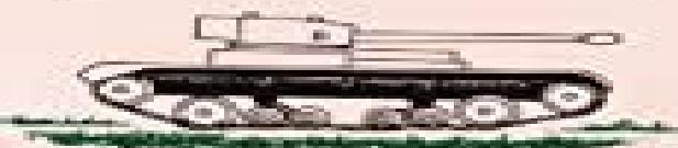
The Valentine Mk VIII British Tank