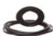
Tub Seal Gasket