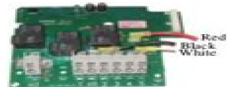
New Relay Board

Note: Make sure to slide cover bracket into slot in the metal guard.