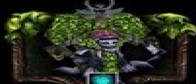
TREE OF LIFE