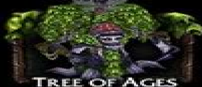
TREE OF AGES