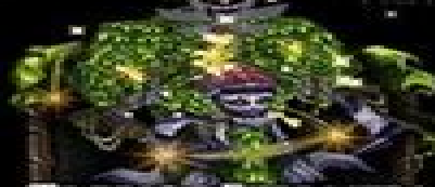
TREE OF ETERNITY