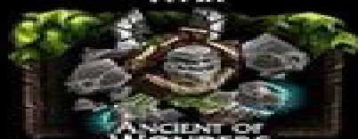
ANCIENT OF WONDERS