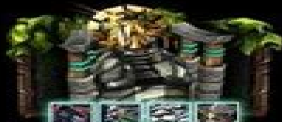
ALTAR OF ELDERS