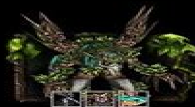
ANCIENT OF WIND