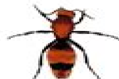
Cow Killer Wasp