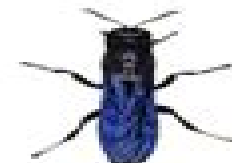
Organ Pipe Mud Dauber