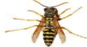
European Paper Wasp