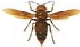
Asian Giant Hornet