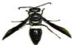
Four-Toothed Mason Wasp