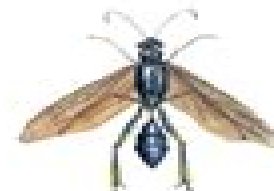
Common Blue Mud Dauber Wasp