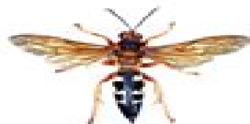
Cicada Killer Wasp