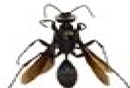
Great Black Wasp