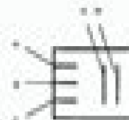
Component Testing Procedures