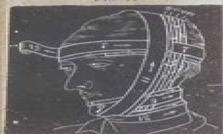
Wooden Case of the Skull