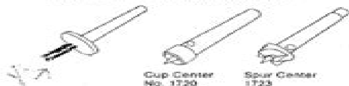
Cup Center No. 1720

The spur and cup centers are shipped as original equipment. Replacements are available. A screw center is used in headstock for work which must be held more securely and for small block turning. The live center is used in the tailstock in place of cup center. This center has a ball bearing and turns work smoother and easier than non-revolving cup center.