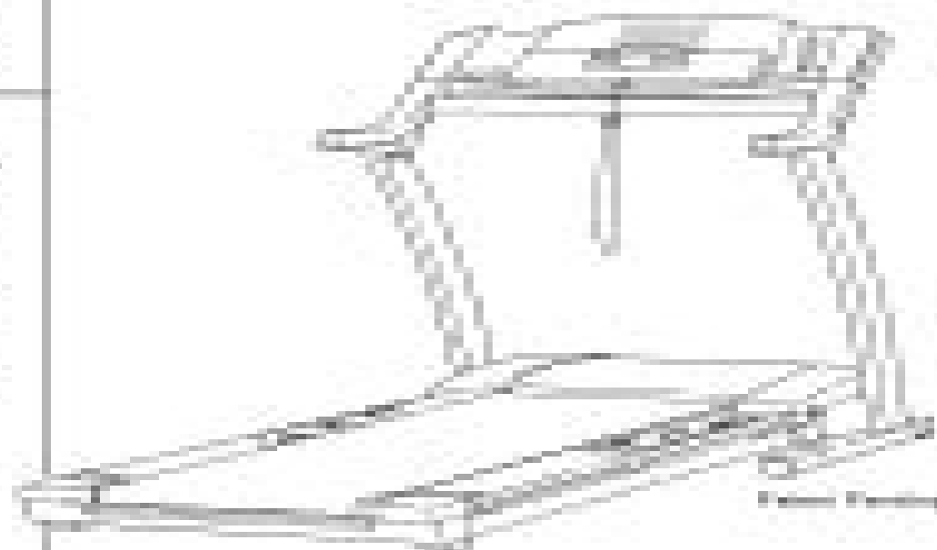
Figure 1: Treadmill

Read all instructions and warnings before using this equipment. Failure to follow instructions may result in serious injury or death.