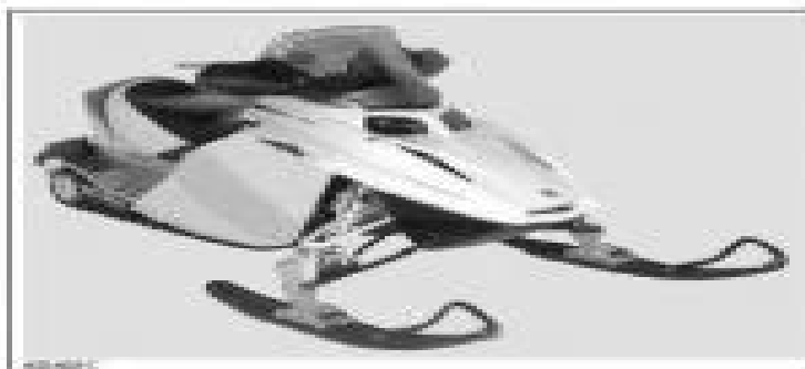
TYPICAL — REV. SERIES