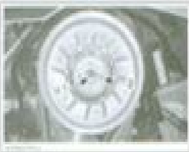
Fig. 06-01-03 1. Drive belt 2. Drive pulley rim

4. Using the work plug (not included) in the tool set or an 11/16" (17.8 mm) round plug of the working material, insert