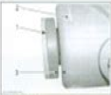
Fig. 06-01-02 1. Drive pulley rim 2. Drive belt adjustment ring

NOTE: Overtightening wheel ring will result in drive belt adjustment and reduce drive belt life span.