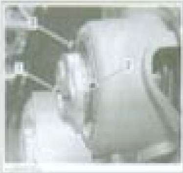
Fig. 06-01-07 1. Drive belt 2. Drive pulley rim

5. Set the other belt screws so that it seats on the wheel ring.