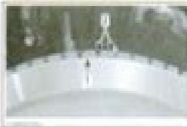
Fig. 06-01-06 1. Drive belt 2. Drive pulley rim

The bottom of grooves on the external side of drive belt must fit the drive pulley edges.