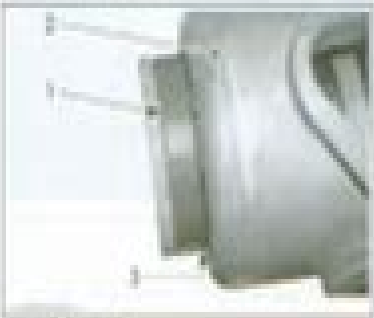
Fig. 06-01-01 1. Wheel ring 2. Drive pulley rim

1. When the drive belt is properly installed, ensure that the wheel ring faces against the drive pulley rim.