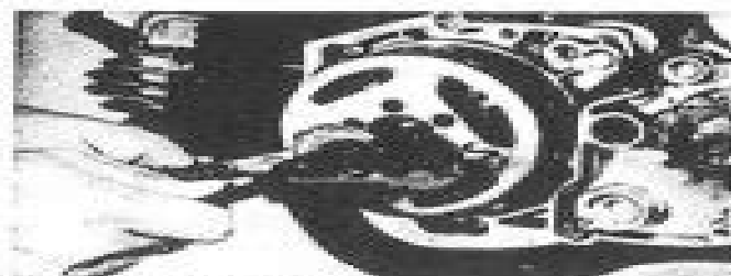
1. FLYWHEEL PULLER