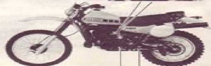
Shift pedal Ratcheting type 6-speed transmission (TT250G)