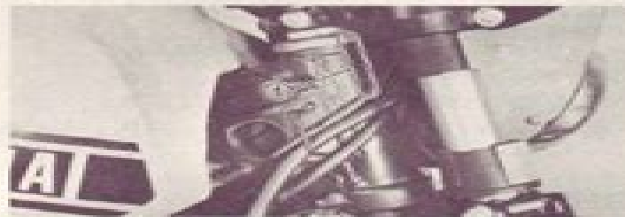
1. Frame serial number

The frame serial number is stamped on the right side of the steering head stock.