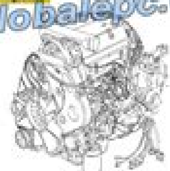
CABLE ON ENGINE